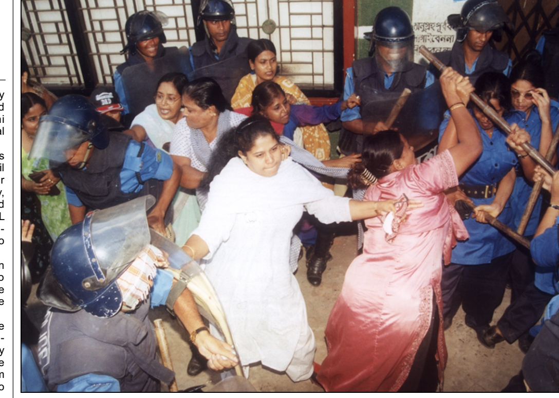
Activists of the Bangladesh Mahila Awami League wrestle with police, who stopped them from entering the party's Bangabandhu Avenue office in the city vesterday.

Sources said the higher authorities have directed police to take all steps to ensure that a ruling party procession as part of its founding