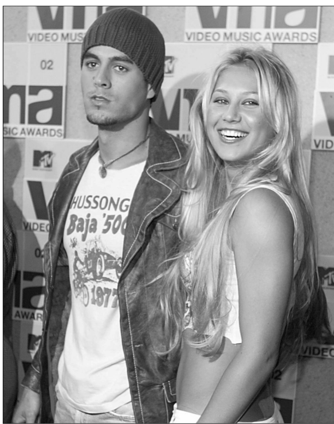
International pop artiste Enrique Iglesias and Russian tennis star Anna Kournikova arrive at the MTV Video Music Awards in New York on August 29.

In other men's results, it was: No. 13 Roger Federer, 6-3, 6-1, 6-3 over Michael Chang; No. 14 Jiri Novak over John van Lottum 6-4, 7-6, 6-1; No. 20 Younes El Aynaoui over Hicham Arazi 6-3, 6-4, 2-0 retired; No. 22 Marcelo Rios over Robin Soderling 6-4, 3-6, 6-3, 6-3; No. 25 James Blake, 6-3, 4-6, 6-1, 6-3 over Nikolay Davydenko; Jan-Michael Gambill, 6-3, 6-3, 6-1 over No. 9 Carlos Moya; and Wayne Ferreira, 1-6, 6-7, 6-4, 7-5, 6-4 over No. 8 seed Albert Costa, the French Open champion.