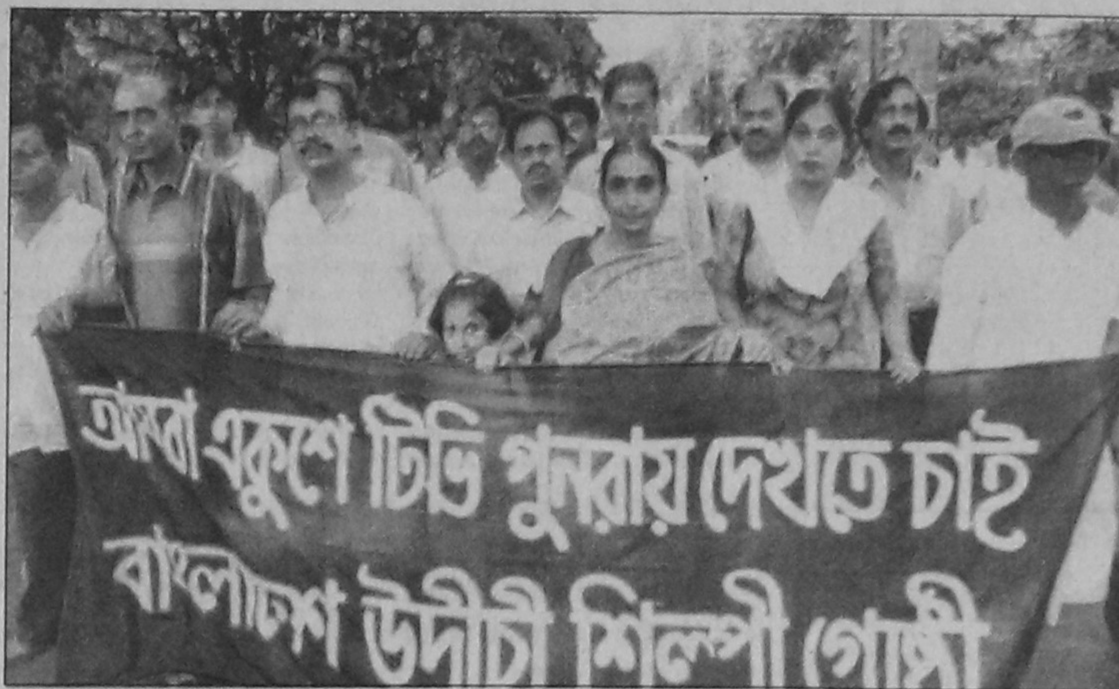
The Udichi Shilpi Goshthi staged a demonstration in the city yesterday demanding that the Ekushey Television be allowed to broadcast again.

UNB, Dhaka Acting President Muhammad Jamiruddin Sircar and Prime Minister Khaleda Zia yesterday felicitated the Malaysian king and the prime minister on the occasion of the 45th National Day of Malaysia. In a message to Malaysian King Tuanku Syed Sirajuddin Syed Putra Jamalullail, the acting president said, "It is my firm belief that the existing friendly relations between the two countries will be further strengthened and consolidated in the years to come." In another message to Malaysian Prime Minister Dr Mahathir Bin Mohamad, Khaleda Zia said, "I'm confident that the friendship and cooperation that mark the relations between the two brotherly countries will continue to grow in the years ahead to the mutual benefit of our two peoples." Leader of the Opposition in Parliament Sheikh Hasina has also felicitated the Malaysian prime minister on the same occasion.