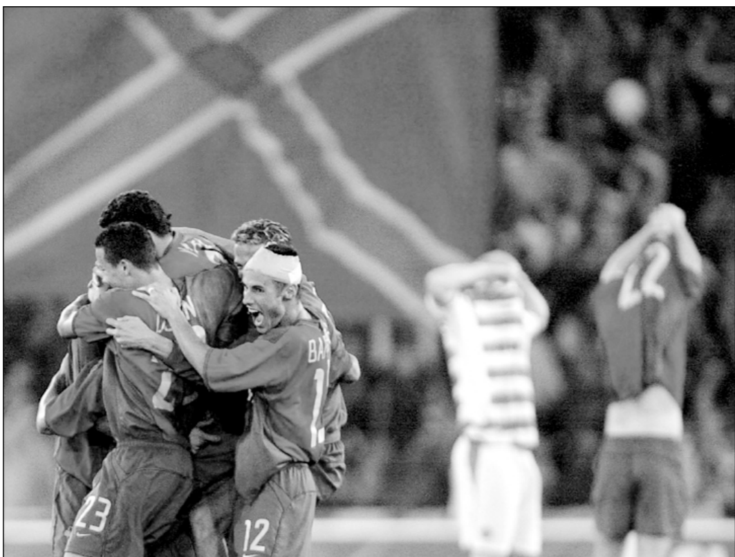
Players of FC Basel are over the moon after their shock win over Glasgow Celtic in the Champions League qualification match in Basel, Switzerland on August 28.

After just a minute of play Liberec drew level when Miroslav