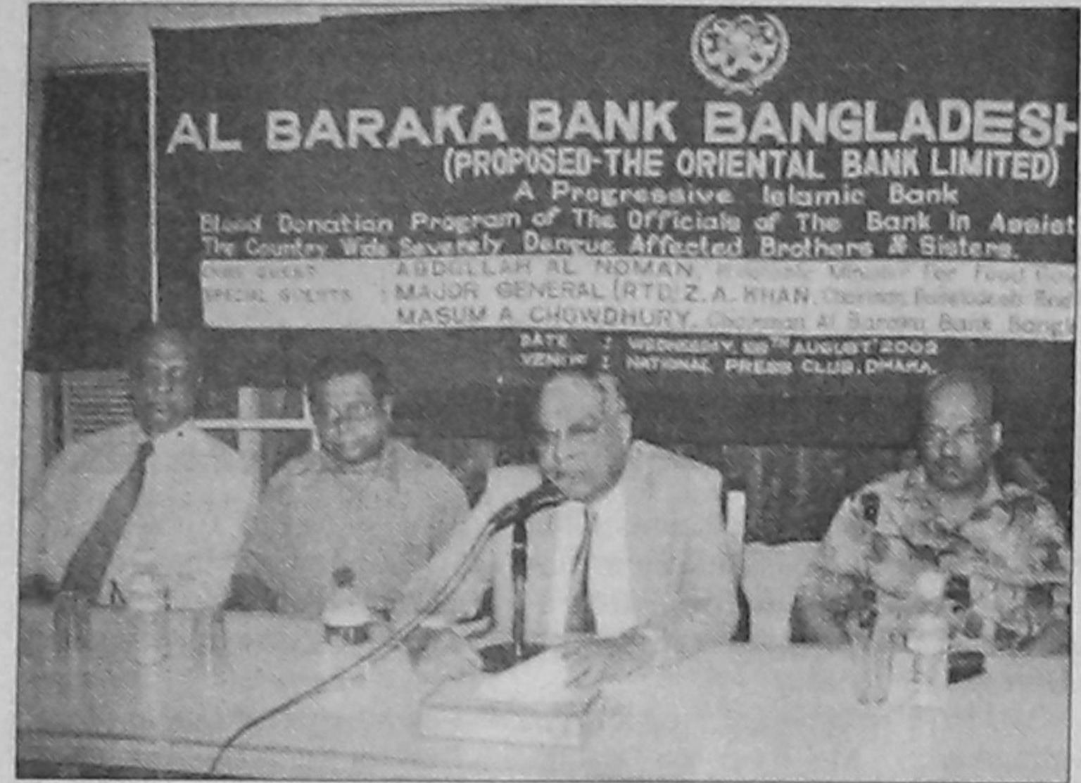
Al Baraka Bank Bangladesh Ltd held a function on the occasion of its blood donation programme for the dengue patients at the National Press Club in the city yesterday.