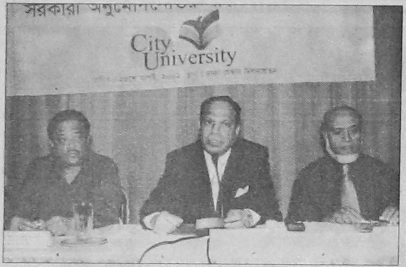
The authorities of the City University held a press conference at DCCI hall in the city on August 25 on the occasion of its launching in September.