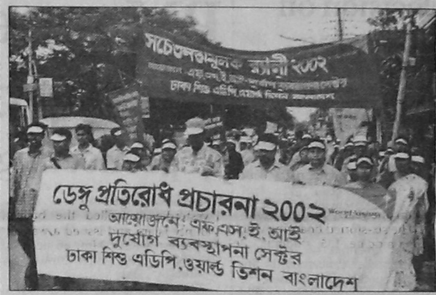
The Dhaka Shishu Area Development Programme, a project of World Vision Bangladesh, took out a colourful procession at Mohammadpur in the city yesterday to raise awareness about dengue fever.