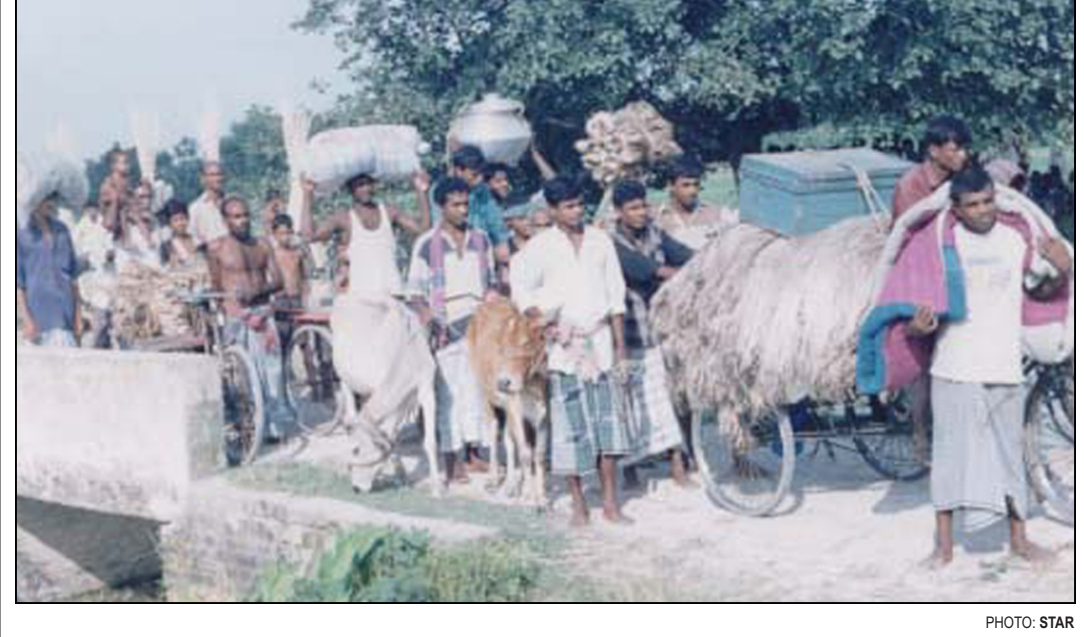
Panic-stricken villagers of Sarongodia in Sreepur Upazila, Magura flee their homes following Monday's clash between rival armed groups of the ruling party.

ment is undermined then it SEE PAGE 11 COL 3