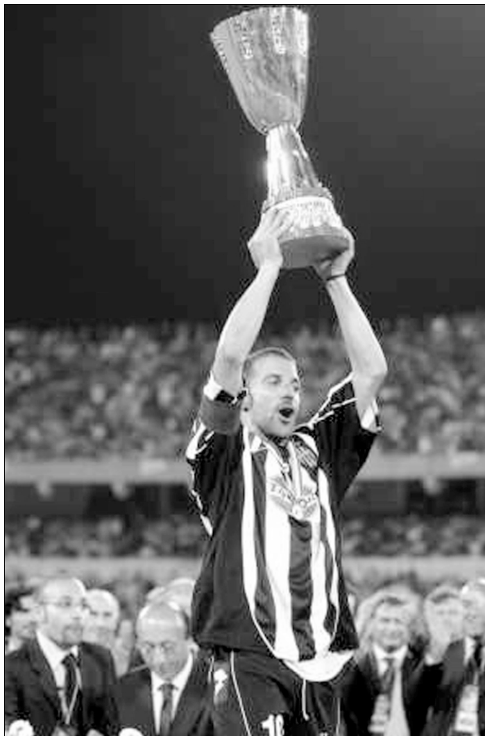
Alessandro Del Piero, Juventus' inspirational star, lifts the Italian Super Cup trophy at Tripoli's "June 11th" stadium on August 25.

But within a minute Di Vaio had given Parma a deserved equaliser