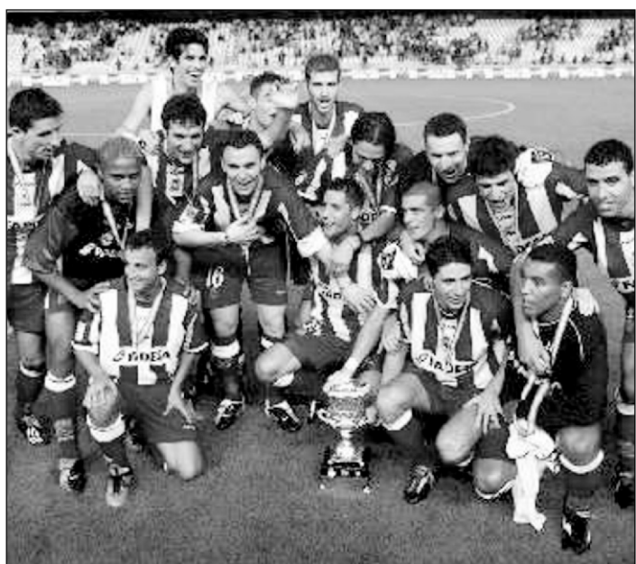
The jubilant Deportivo Coruna's squad with the Spanish Super Cup trophy after beating Valencia in the second leg at Valencia on August 25.

Depor, who were content to play on the break, had the clearest scoring chances but Canizares produced several sharp saves to stop Victor and Makaay.