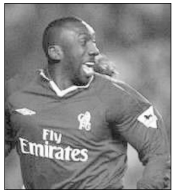
JIMMY FLOYD HASSELBAINK

The 30-year-old Dutchman, formerly with Leeds United, moved to Chelsea for a then record equal-