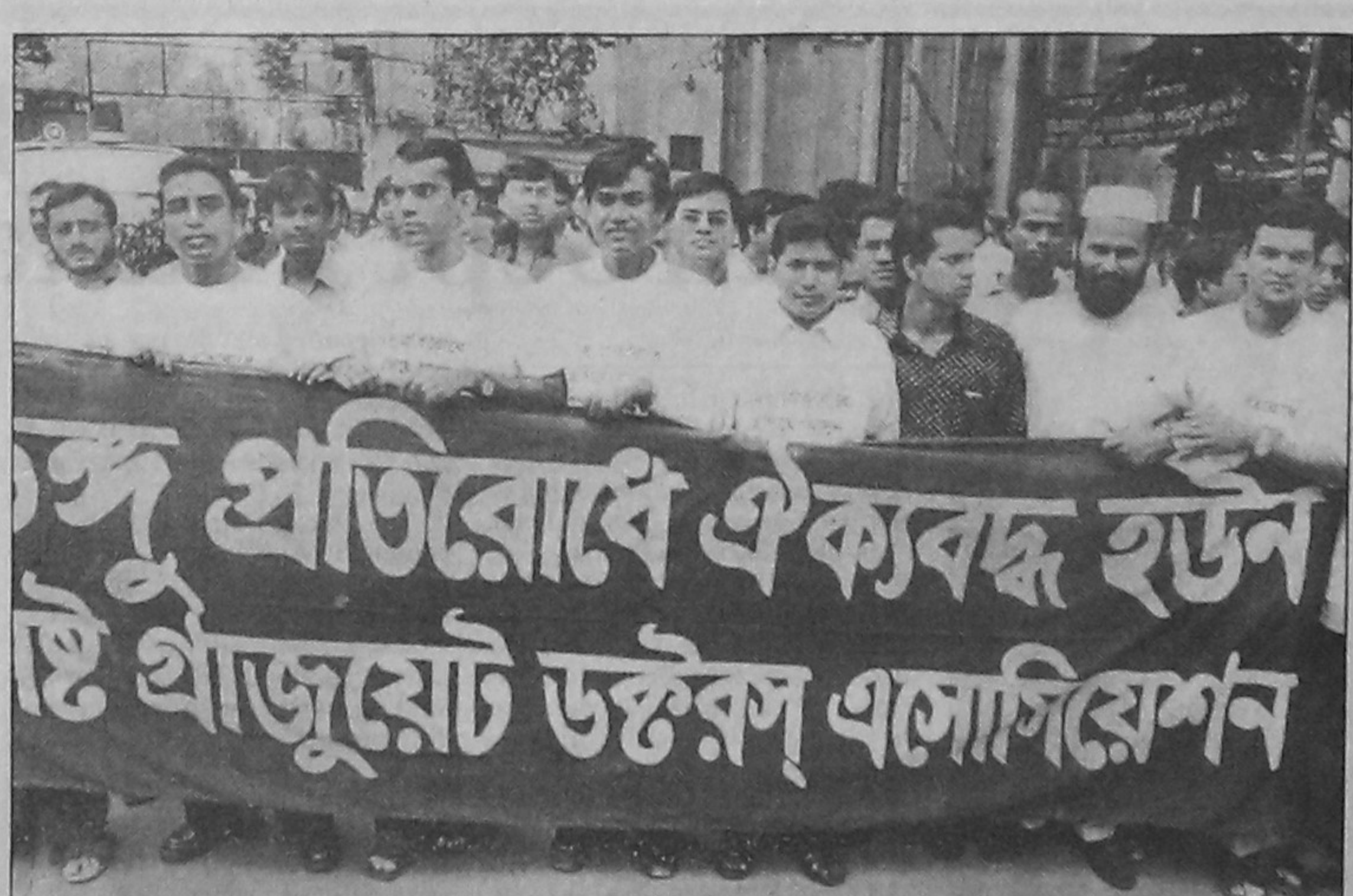
The Post Graduate Doctors' Association took out a procession at the Bangabandhu Sheikh Mujib Medical University (BSMMU) in the city yesterday to raise awareness about dengue fever.