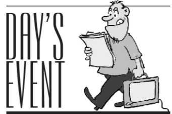
National Bank Premier Football League Mohammedan vs Muktijoddha (6:00 pm) Venue: Bangabandhu National Stadium.

Australia captain Steve Waugh on Friday was forced from the field in Kent's match against Leicestershire after struck on the hand by a delivery from former England fast bowler Devon Malcolm. Waugh, who has replaced Andrew Symonds as Kent's overseas player until the end of the season, failed to react to a ball that leapt off a good length. He was immediately assessed by the physio at the end of the sixth over and was taken to hospital for a precautionary X-ray. He was later cleared to resume playing. It is Waugh's first championship fixture for Kent, although he played a match-winning knock on his debut in the Norwich Union League win over Leicestershire on Wednesday.