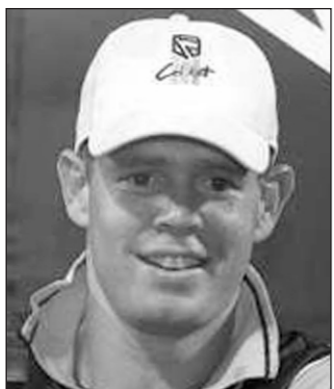
Shaun Pollock (South Africa cricket captain) "I know this is only the start of the World Cup season, but it is always disappointing to lose a final." After losing the Morocco Cup final against Sri Lanka.