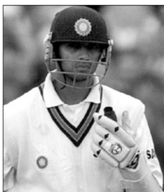
DRAVID ... 148

too short on Thursday, reacted by going to the other extreme and generally over-pitched. Meanwhile in a bid to restore control, England's Madras-born captain Nasser Hussain brought Giles on. And he was rewarded when, in the ninth over after lunch he Warwickshire Giles had Dravid stumped for 148 by Alec Stewart, the turn beating the batsman's defensive push after he advanced down the pitch. Dravid, nicknamed 'The Wall' for his resilience faced 307 balls including 23 fours in an innings lasting over seven hours.