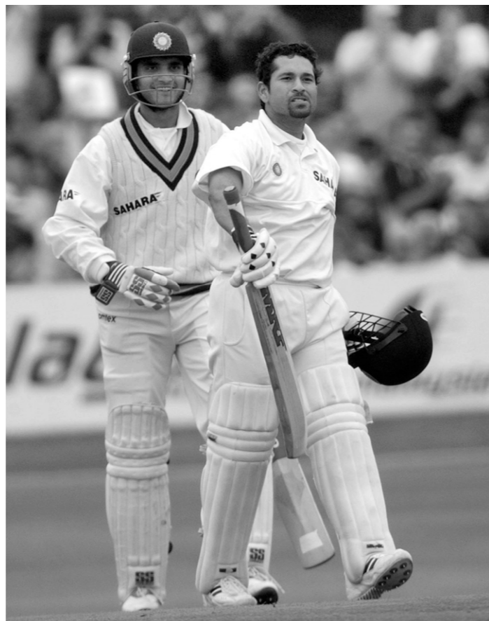
HAPPIEST HUNDRED: India's batting maestro Sachin Tendulkar salutes the crowd after completing his record 30th Test hundred at Headingley yesterday. His captain Sourav Ganguly watches.