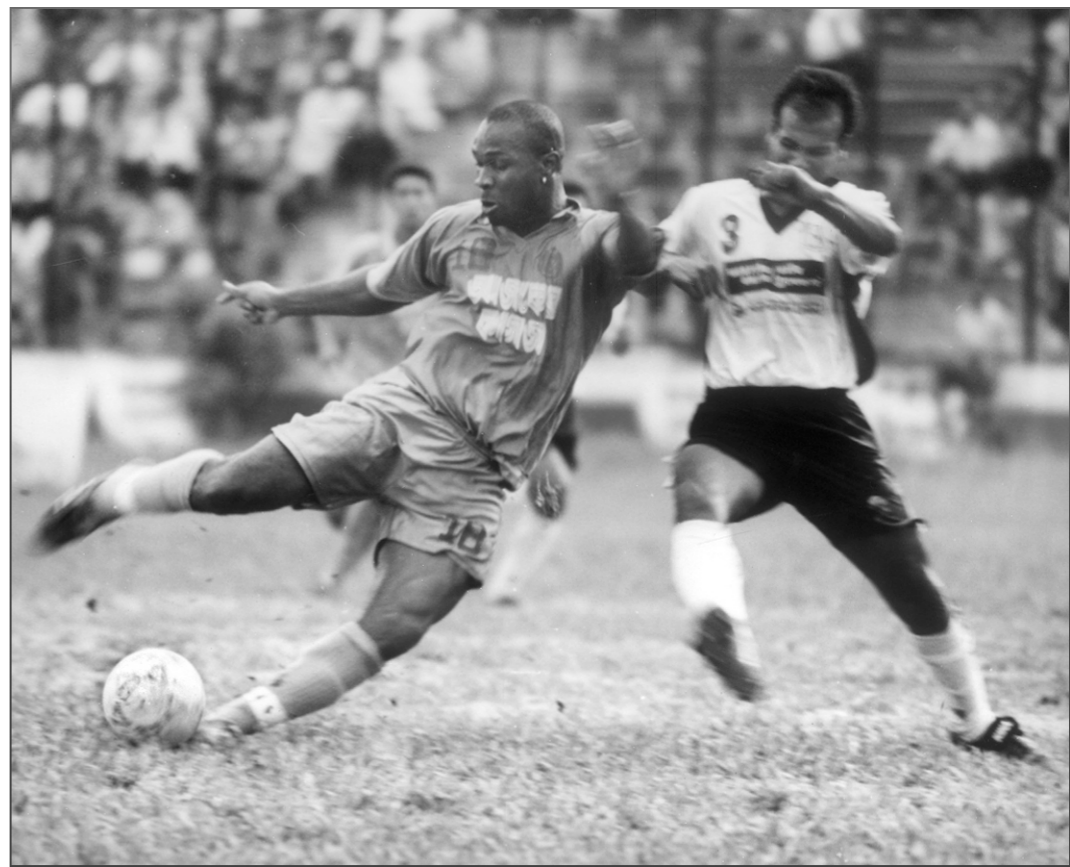
Action from yesterday's National Bank Premier Division Football League match between Abahani and Arambagh at the Bangabandhu National Stadium.