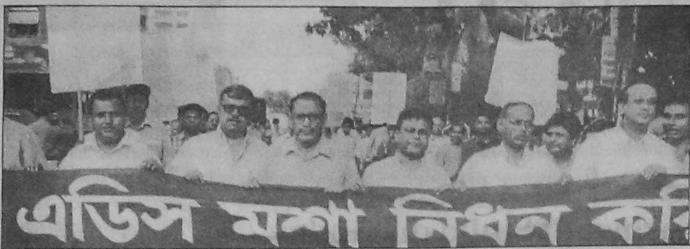
The Doctors' Association of Bangladesh took out a procession in the city yesterday to raise awareness about dengue fever.