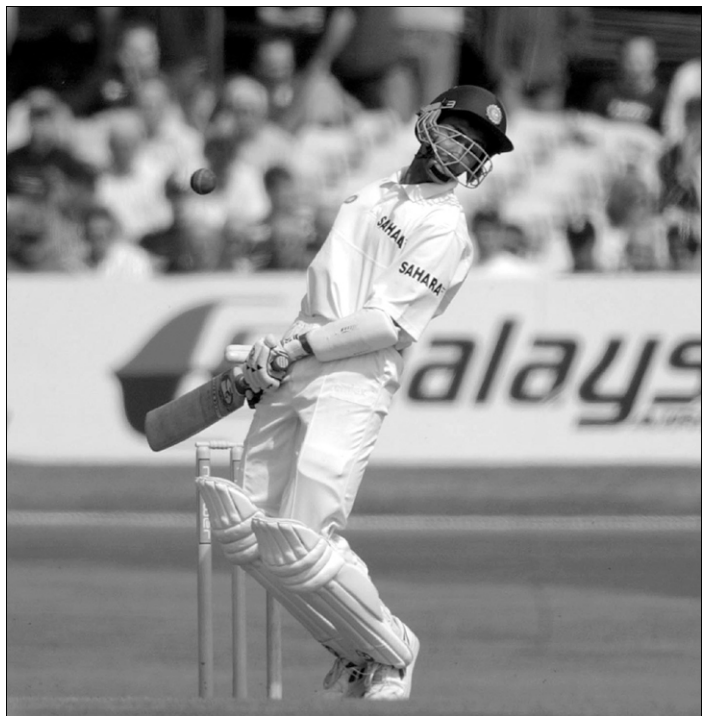
Indian opener Sanjay Bangar evades a rising delivery on the opening day of the third Test against England at Headingley yesterday.