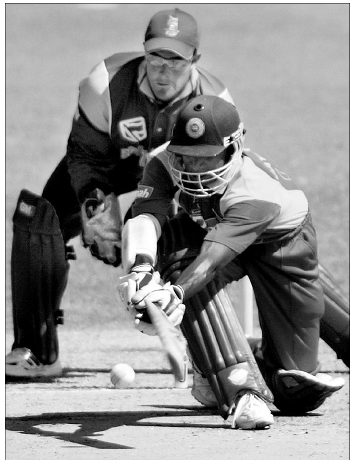
Sri Lankan skipper Sanath Jayasuriya sweeps during the final of the Morocco Cup against South Africa at Tangiers yesterday.