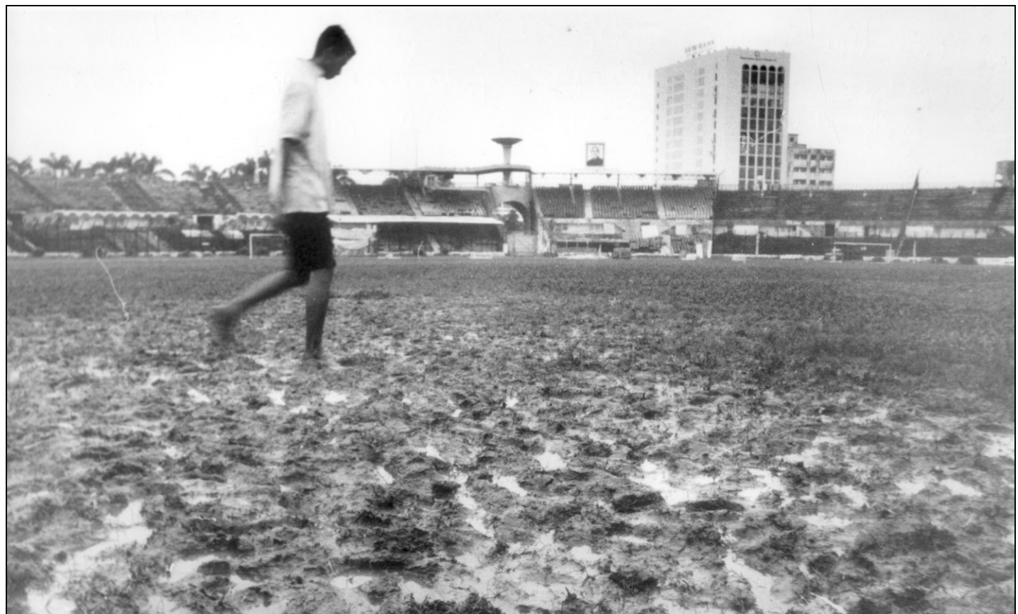
FIT FOR AGRICULTURE! The ground at Bangabandhu National Stadium has virtually turned into a paddy field courtesy of rain and the ongoing National Bank Premier Division football league. This photo was taken yesterday.