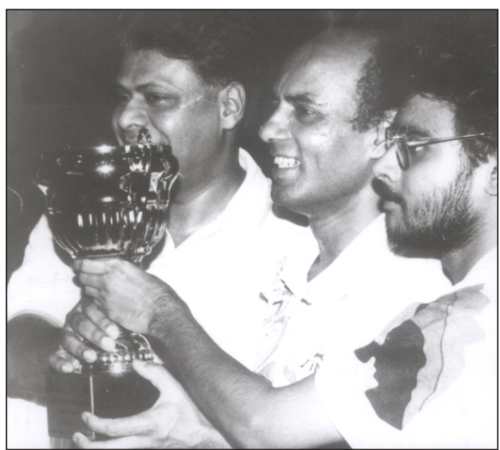
Biman players hold the winner's trophy after beating Wari Club in the AB Bank Metropolitan Senior Division Table Tennis League last match yesterday.