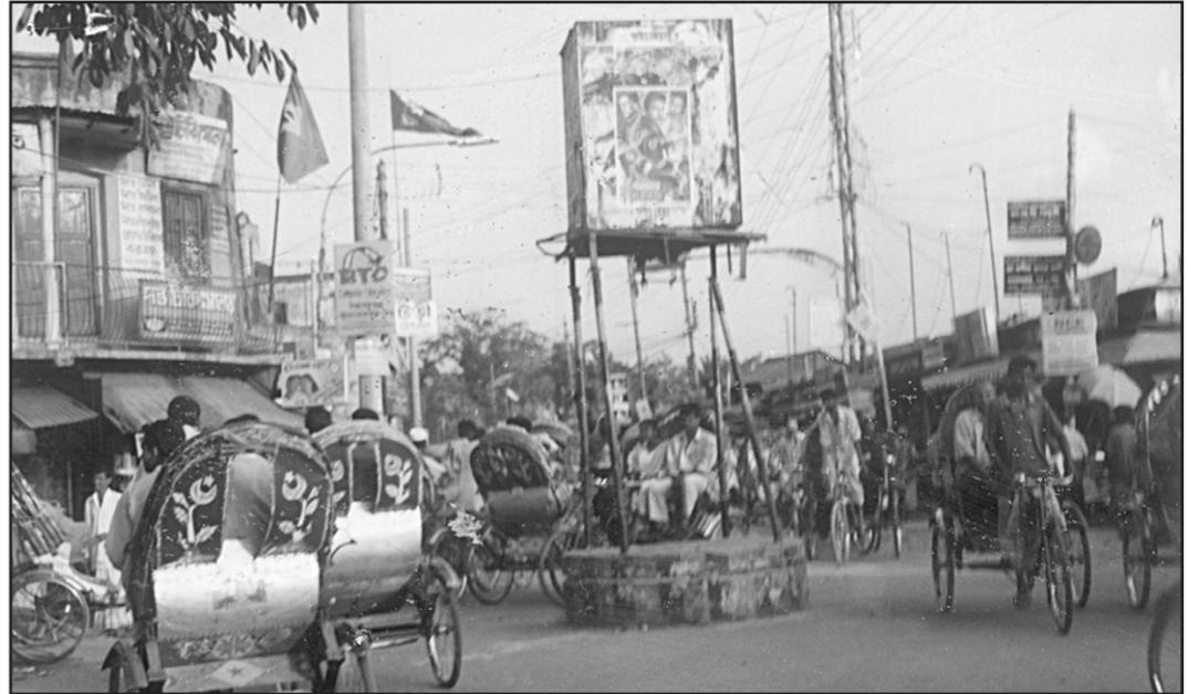
An important traffic island at the main gate of Mymensingh Railway Station is seen without any traffic police. Frequent traffic jam is a regular feature at this very important intersection in this district town.

They also decided to lodge a case with Matihar police station in this connection.