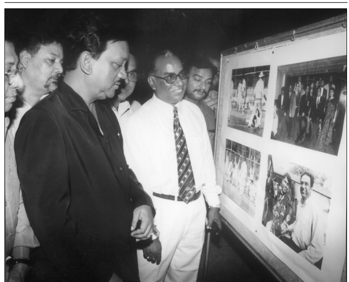
State Minister for Youth and Sports Fazlur Rahman looks at photographs after inaugurating an exhibition of sports photos organised by the Bangladesh Photo Journalists' Association in connection with the World Photography Day at the Jatiya Press Club yesterday.

The stand-off is seen as a serious threat to the multi-million dollar deal between the ICC and Global Cricket Corporation, who have bought the rights to all ICC events until 2007.