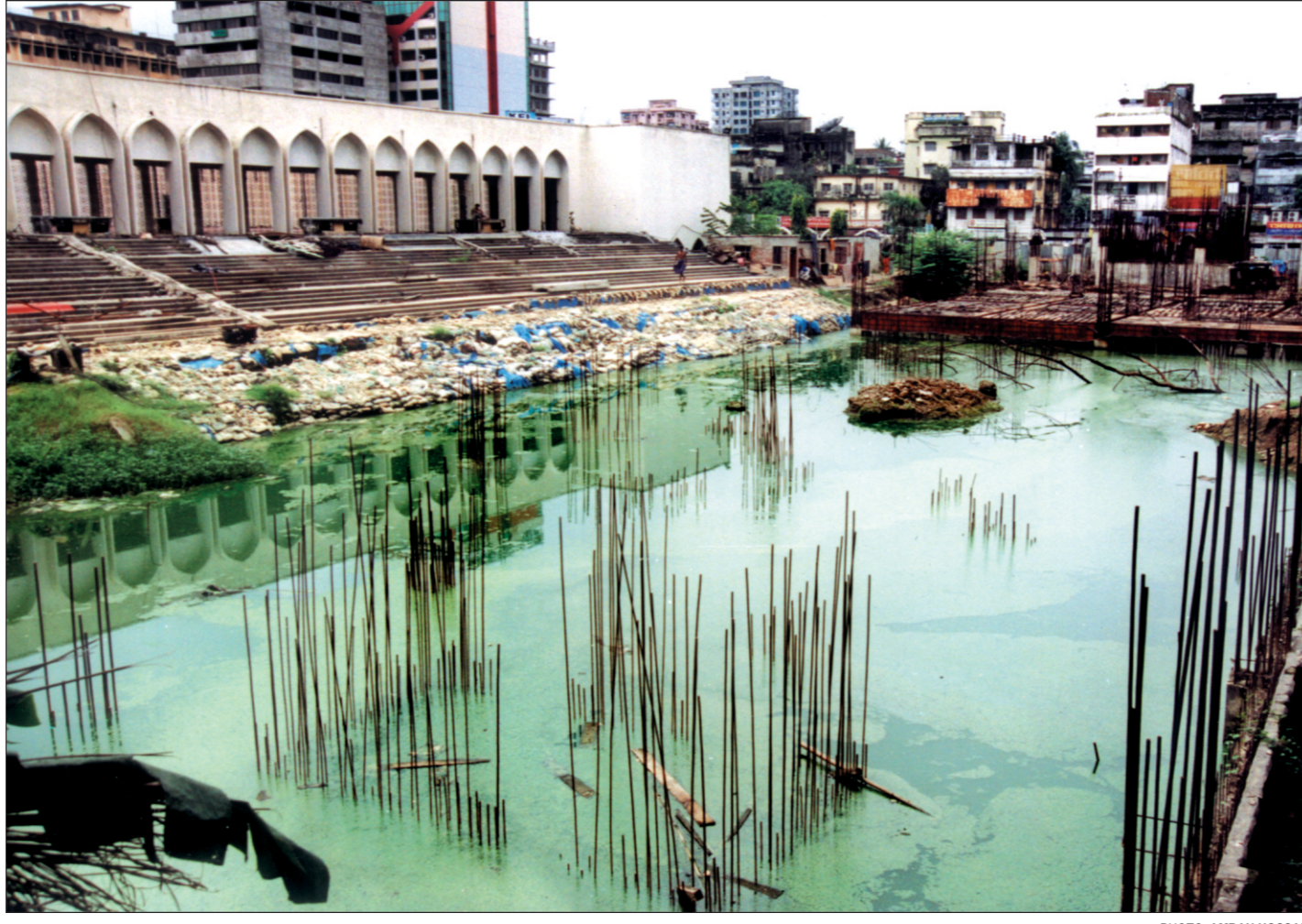
Stagnated water in the under-construction area of the Baitul Mukarram Mosque, a suspected breeding ground for aedes, sums up the laid-back attitude of the Dhaka City Corporation in fighting the dengue outbreak.

STAFF CORRESPONDENT The ruling Bangladesh Nationalist Party (BNP) has decided to drop Sylhet from the Chittagong-Sylhet divisional representatives meeting.