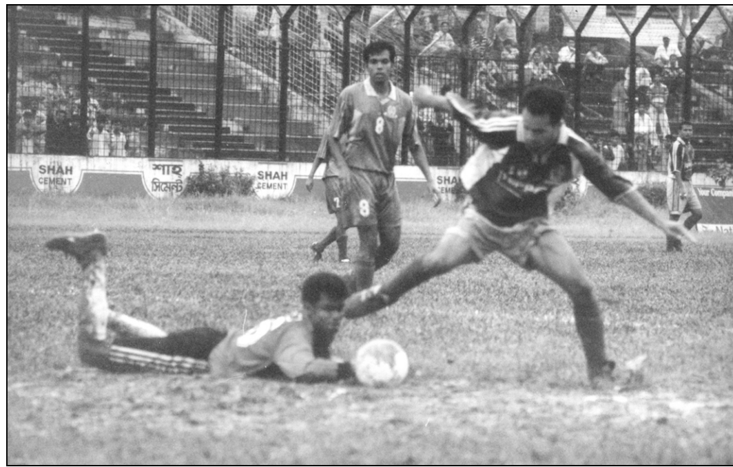
Action from yesterday's National Bank Premier Division Football League encounter between Farashganj SC and Badda Jagarani at the Bangabandhu National Stadium.