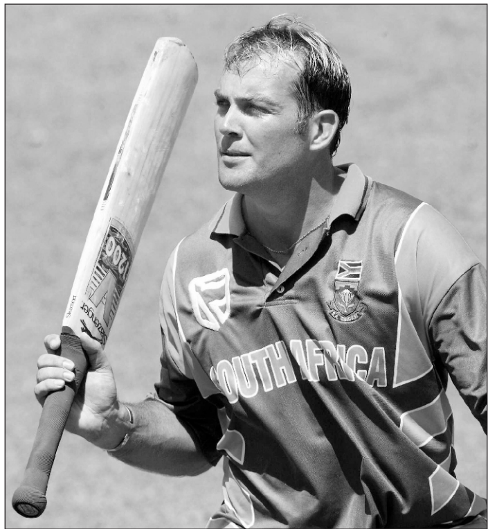
South African star batsman Jacques Kallis raises his bat after reaching fifty against Sri Lanka in the Morocco Cup tri-series yesterday.