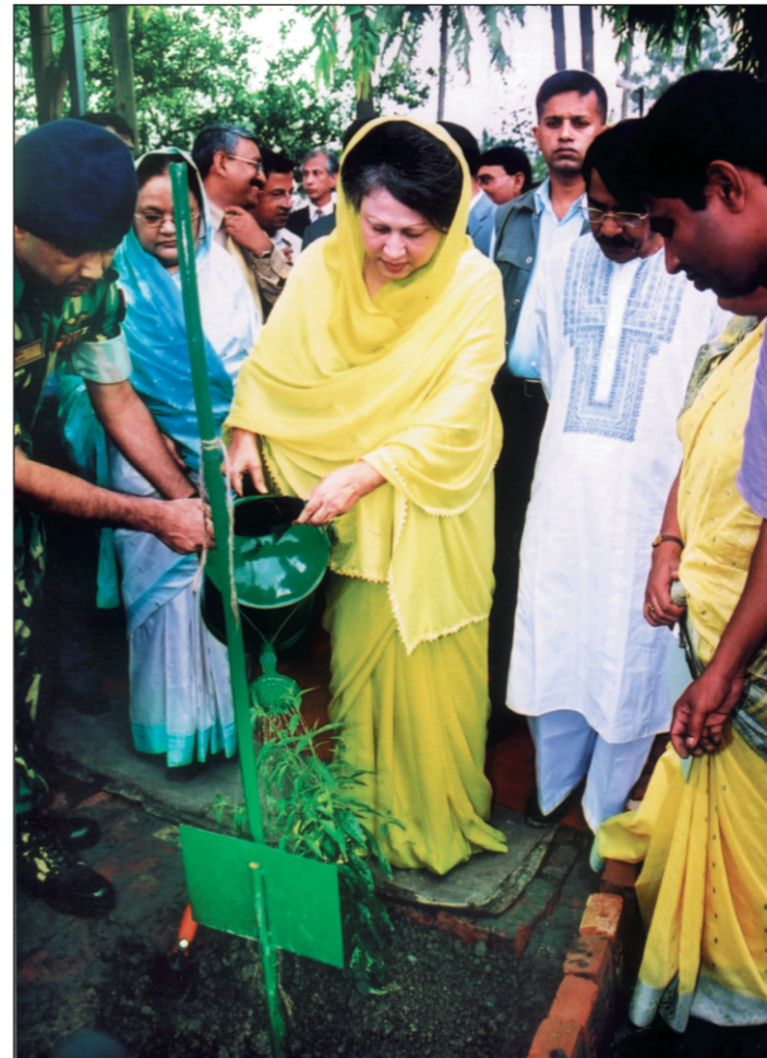
Prime Minister Khaleda Zia plants a nim tree in Banasraya on her office premises yesterday.

STAFF CORRESPONDENT The Dhaka City Corporation (DCC) has temporarily suspended the earth filling of the Haikkar canal in the city's Mohammadpur area following the reports in The Daily Star. In spite of that the contractor of the project and the Commissioner of Ward-46, Abu Sayed Bepari continued to fill up this natural canal at night. Over the last few days the canal have been filled with several barges of earth which must be removed to ensure the proper flow of the canal, local people said. Commissioner Abu Sayed Bepari went on to block the passage of the canal by dumping slabs in the water under the small culvert. The Haikkar Khal is one of the last remaining and fast flowing canals in the city, which