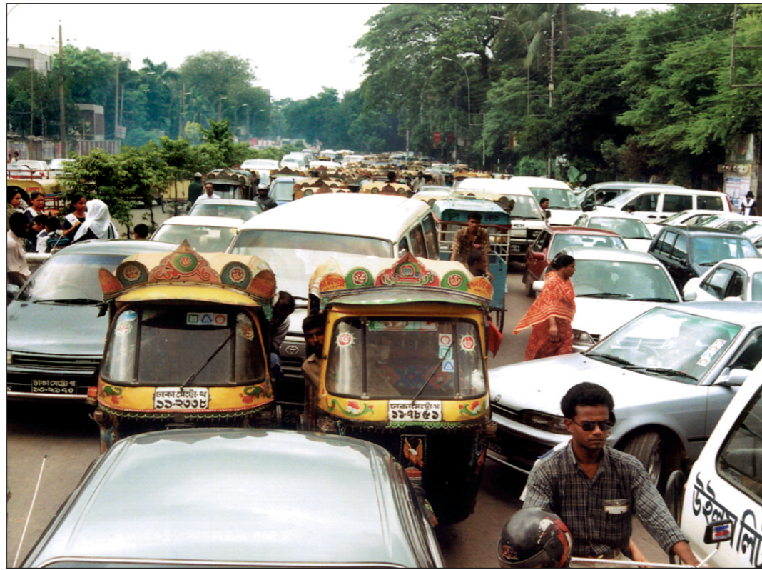
Haphazard traffic in front of the city's Willes Little Flower School with no parking lot leaves vehicles in a bumper-to-bumper gridlock every day. Yesterday was no exception.

STAFF CORRESPONDENT The Officers' Welfare Association of Titas Gas Transmission and Distribution Company has called a meeting of its executive committee today in the face of growing pressure from the pro-BNP trade union in the company. The "all-powerful" trade union in the state-owned company has "dictated" the agenda of the meeting, due to be held at 4.01pm, sources in the association said. The agenda a fresh election to the officers' body aims at replacing the incumbent leaders with those preferred by the trade unionists, the sources said. The two-year term of the executive committee is due to expire in July next year. But, the pro-BNP trade union that seized "control" of the Titas trade union in October last year ousting three other union activists