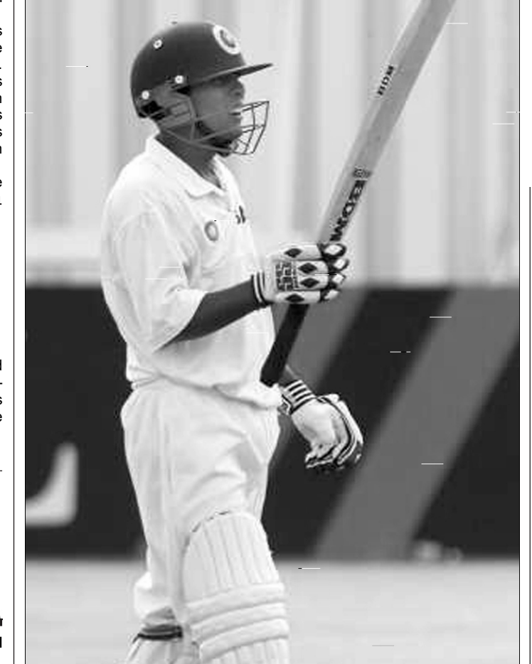
Indian batsman Shiv Sunder Das raises his bat after reaching 250 not out