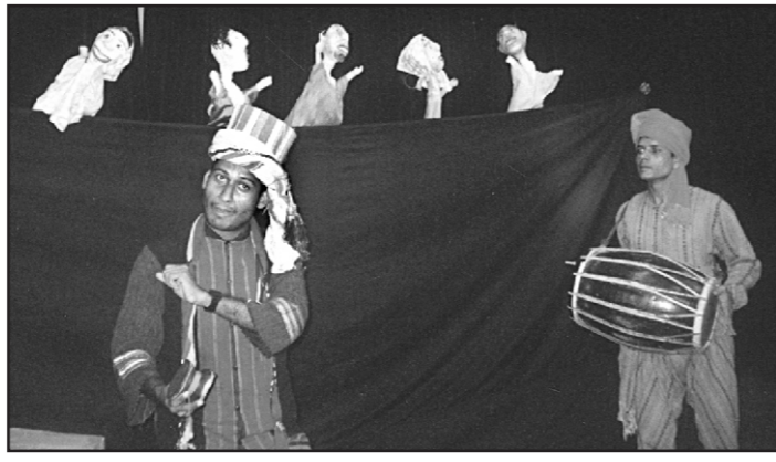
Hand puppetry is a new concept in local culture

Al-Amin, the fictitious character of young boy in the play have been shown trafficked to a country in the Middle East and forced to work as a camel jockey where he apparently met a tragic end of his life, after a