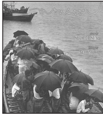
Cover of the book

The writer, Sudeep Sen, was born in New Delhi in 1964. He has written and edited over twenty books, including Postmarked India: New and Selected Poems (HarperCollins), which was awarded the Hawthornden Fellowship (UK) and nominated for a Pushcart Prize (USA). He has written for numerous prestigious publications, among others, the Times Literary Supplement .