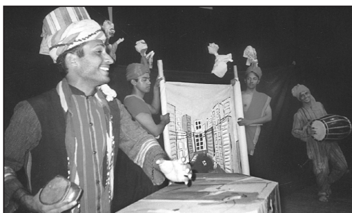
Lyrical narration gives extra boost to puppet show

The theatrical puppet production also contributed in raising awareness on the importance of education and literacy of guardians in