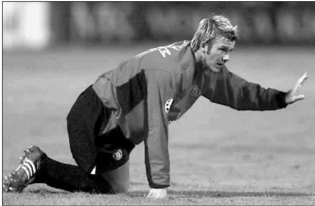
BROUGHT DOWN ON KNEES! Manchester United superstar David Beckham kneels on the pitch during their Champions League third round qualifying match against Hungary's Zalaegerszeg in Budapest on August 14.

Five-time winners AC Milan looked shaky as it edged Slovan Liberec at home thanks to a 68th-minute strike by Filippo Inzaghi, cross-town rival Inter Milan, playing without Brazilian World Cup superstar Ronaldo, held hosts Sporting Lisbon scoreless in a 0-0 draw in Portugal, FC Barcelona got three goals past visiting Legia Warsaw of Poland, a strike by England World Cup midfielder Kieron Dyer gave Newcastle United a 1-0 victory at Zvezdnicar in Sarajevo while Scottish champions Glasgow Celtic fell behind after 90 seconds against FC Basel but fought back to win 2-1 at Parkhead.