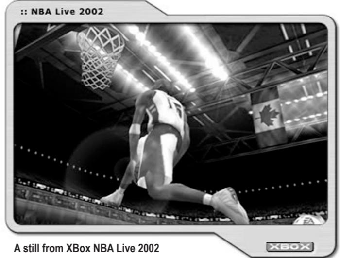
A still from Xbox NBA Live 2002

(retailers)." Microsoft competitors Sony Corp. and Nintendo Co. Ltd. also will enable online gaming for their consoles latter this year. Sony will release a network adapter for the PlayStation 2 as well as related games later this month, while Nintendo has not specified a release timetable for the adapters for its GameCube console. While the Xbox has networking capabilities built-in, it only supports broadband Internet connections; the other two consoles will support traditional dial-up connections. The Sony adapter will support both while Nintendo will release separate adapters for each connection method. Video game hardware and software sales topped $9.4