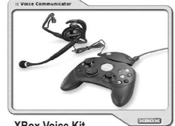
Xbox Voice Kit of games.

billion in the United States in 2001, with sales expected to easily break that record this year, driven by competition among the three consoles and growing mainstream popularity of games. According to surveys by the game industry's trade group, the Interactive Digital Software Association, as many as 31 percent of frequent game players say they play online.