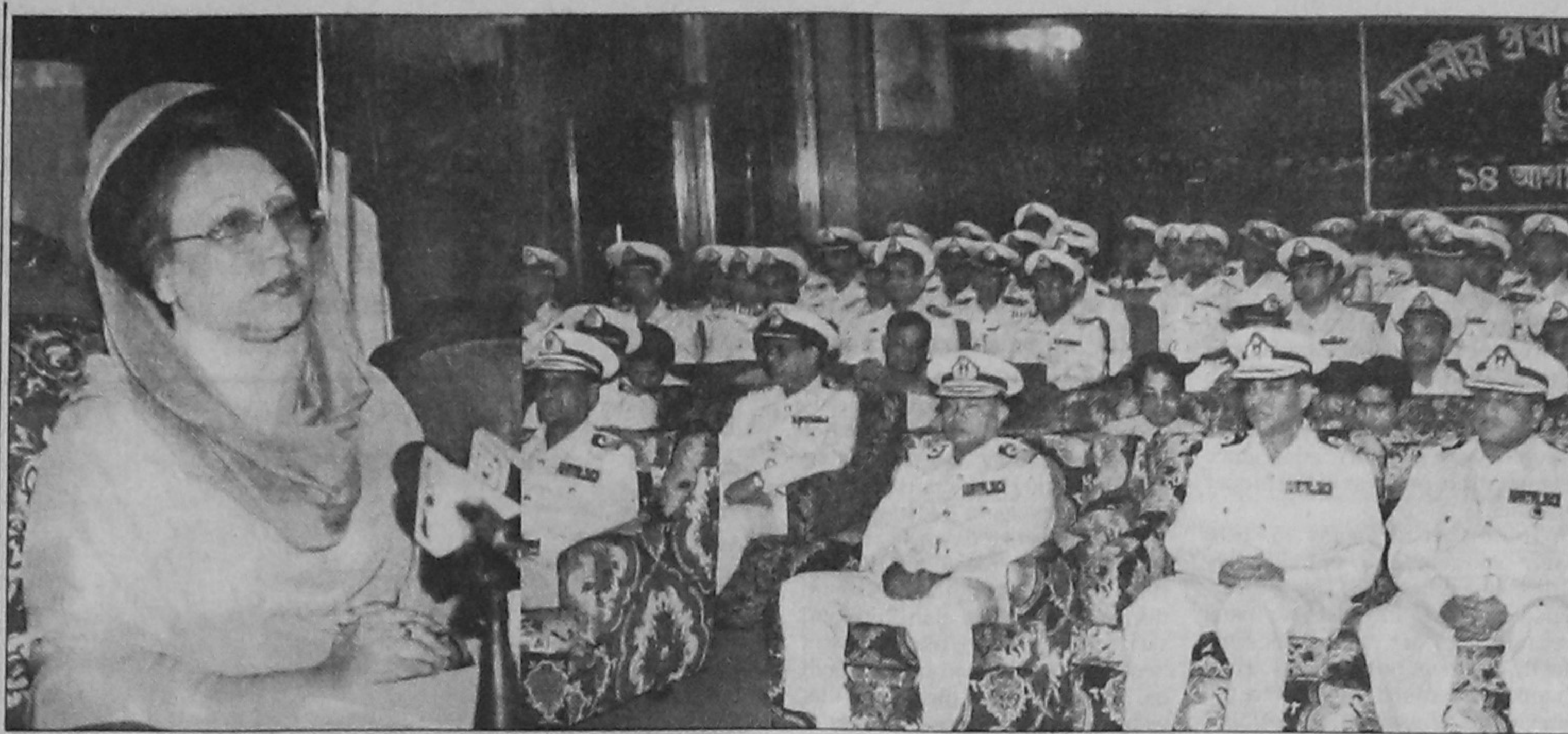
Prime Minister Khaleida Zia addressing the officers of Bangladesh Navy at the Naval Headquarters in the city yesterday.