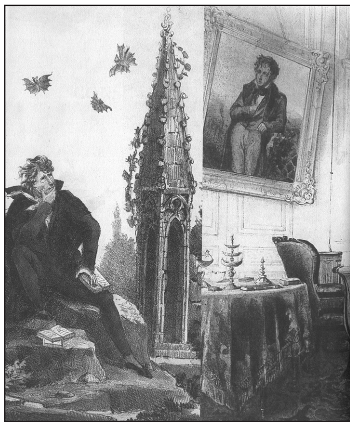
A poster on melancholia, an integral part of Chateaubriand's work

The poster exhibition of Chateaubriand delineates his works as well as his life which explains the reason why he has written what at which time such as the Revolution and how he wanted to denounce the philosophy de Lumiere or even his writing of "The Genius of Christianity".