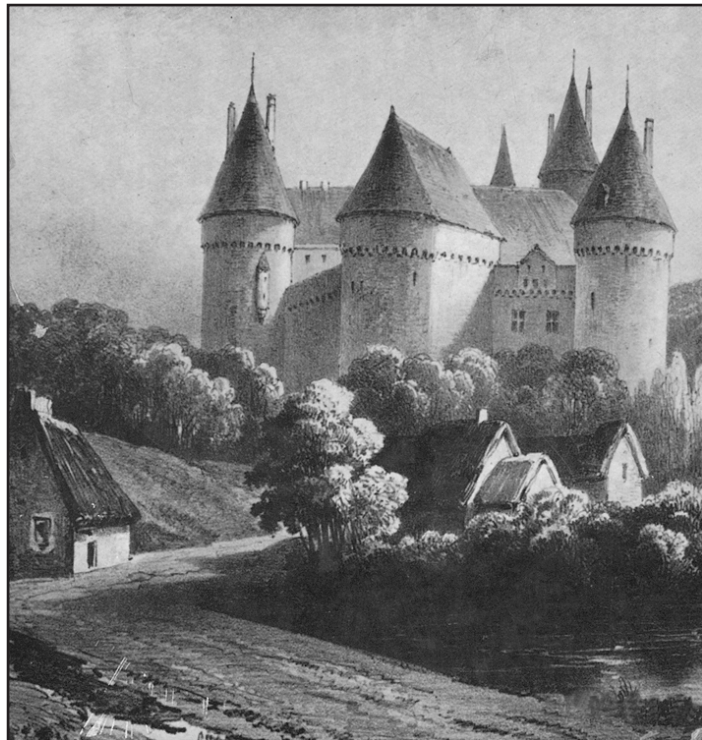
The castle in which Chateaubriand grew up

There is then the illustration of Combourg where he spent his time. He was the first writer of the French Romantics although his environment was not a castle from the Romantic period.