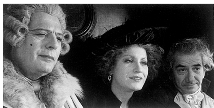
A scene from a film based on Chateaubriand's time, "La Nuit de Varennes" which will be screened at the Alliance Francaise

An eye-catching and scholarly poster exhibition on the famous writer, politician and firebrand, vicomte Francois-Auguste-Rene Chateaubriand, is being held at the Alliance Francaise from 9" to 30" of August to illustrate his life and his works.