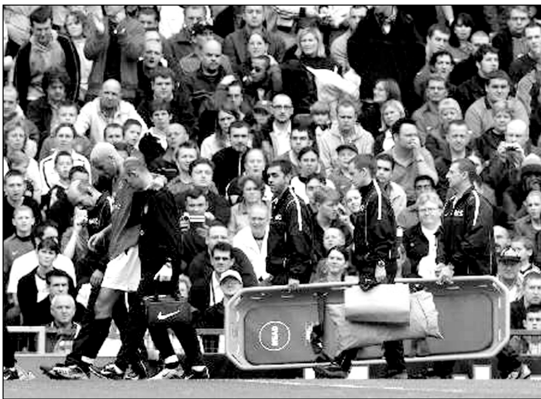
Manchester United defender Rio Ferdinand is assisted off the pitch after suffering an injury during the friendly match against Boca Juniors at Old Trafford on August 10.