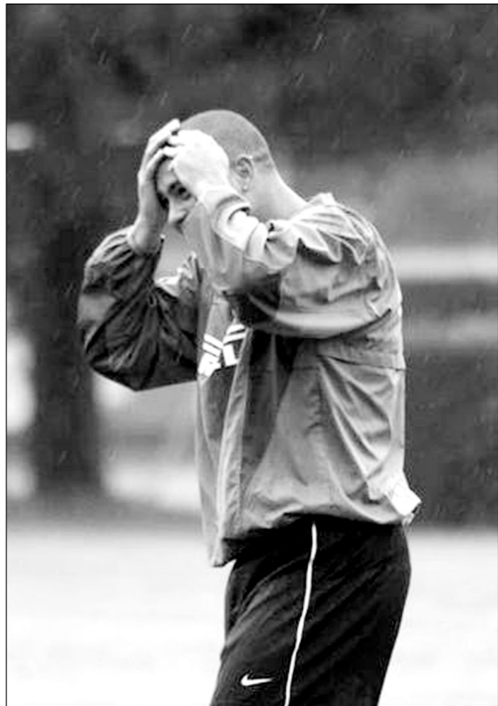
Inter Milan superstar Ronaldo shields the patch of hair on his forehead from rain during a training session at Pinetina yesterday.