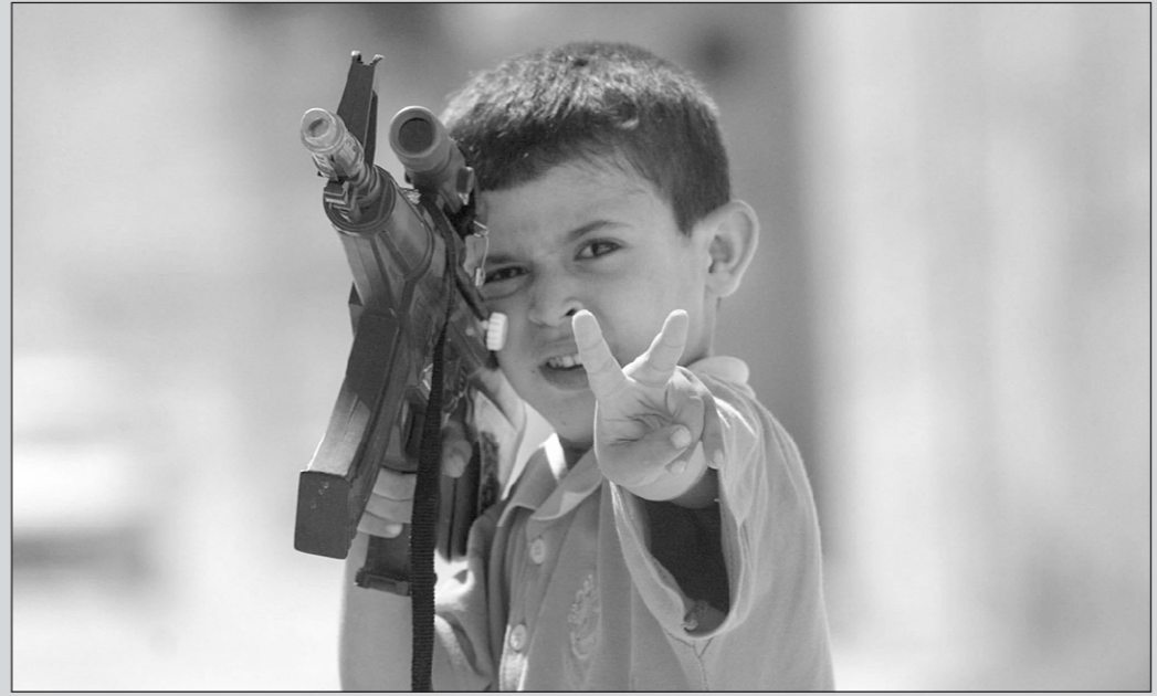
'V' for violence

I often come across a lot of bias opinions regarding student activities and politics. No body should be above law starting from a layman to the Prime Minister. You may not like the VC or Provost but when he/she carries out his/her responsibilities according to the rules and regulations, whether we like it or not, we must have patience and give him/her a chance. If he/she violates law we have judicial system to take care of it. If the University Administration wanted to terminate a provost (whether based on party affiliation or not) if some or all the students did not like it they could have peacefully protested, sat in strike or went for hunger strike or go to the court for justice. But no body has the right to resort to violence. When police (male or female) come to execute the order and enter into a Hall during night or day, they come after taking proper order from a magistrate. If they commit any excesses no body should fight with them but one can sue them and if the excesses are proved in the court of law the victim will be compensated. This is the civilised way of living under law and the educated people should support it wholeheartedly. Our rights are being trampled by the students and the politicians, not by police. They are only carrying out their order of