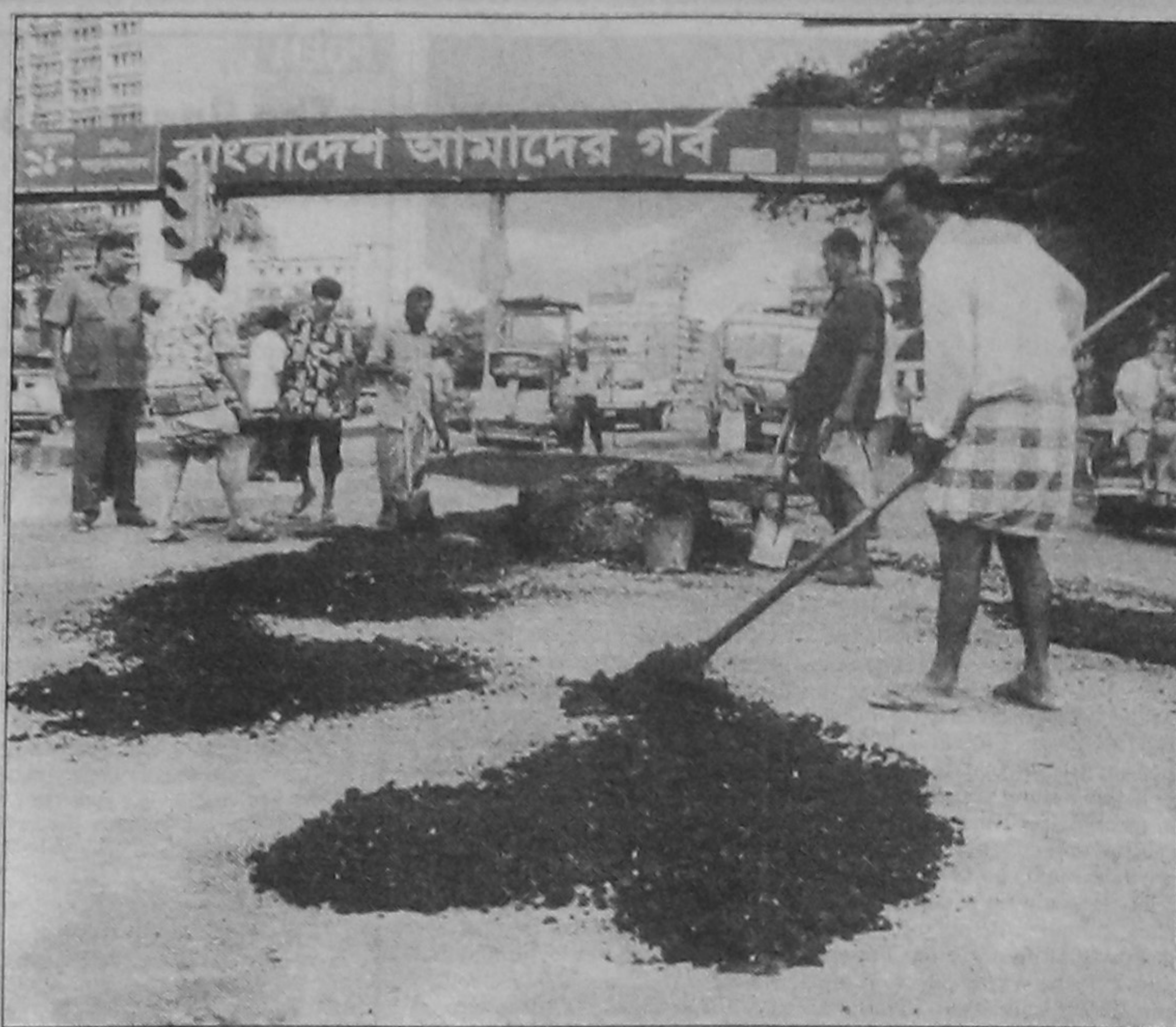
Workers repairing a road near Muktangan in the city yesterday (left) whereas other pothole-strewn roads, such as this road (on the right) near Dhaka Zila Parishad office, which need immediate repair, have been left as they are for long.