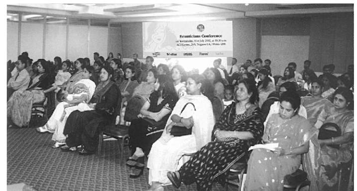
At the conference

The beauticians extended thanks to the management of ACI for organizing the conference and discussed various issues relating to their profession. ACI Management, in return, also reciprocated compliments to the beauticians for their noble profession something that aimed at self-reliance by the women, generated employment and played vital role in beautifying of the female population of the country.