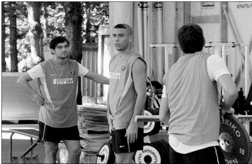
Superstar Ronaldo (C) chats with club mate Sergio Conceicao (L) and another unidentified player at the gym of Inter Milan's training base at Appiano Gentile yesterday

Real had already made it clear in the past week that they would only pursue talks with Ronaldo if Inter made it clear that he was free to talk