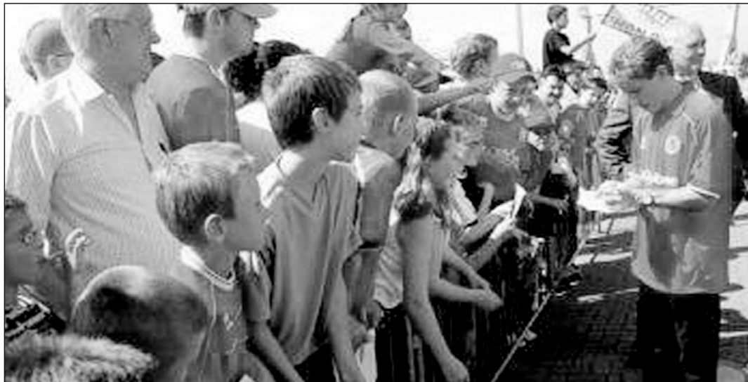
Middlesbrough's Brazilian international midfielder Juninho (R) acknowledges some autograph-hunters as fans celebrate his return to the club for a third time yesterday.