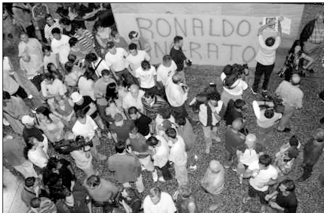
THEY DESERVE AN EXPLANATION: Inter Milan fans stand by a banner reading "Ronaldo Ingrate(Ungrateful)" as they wait for the arrival of the Brazilian superstar at the Milan Malpensa airport on August 6.

Inter hope the star will fire them to the Serie A title this season after showing with his eight World Cup goals that he is back to his top form after three years blighted by serious knee injuries.