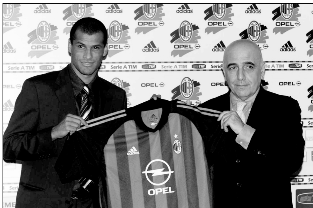
AC Milan's star signing Rivaldo (L) with the club's Vice Chairman Adriano Galliani as he holds his AC Milan jersey at Milan yesterday.

But that potential clash looked in confusion on Wednesday with Ronaldo saying he wanted to leave Inter and his agent saying he was set to stay.