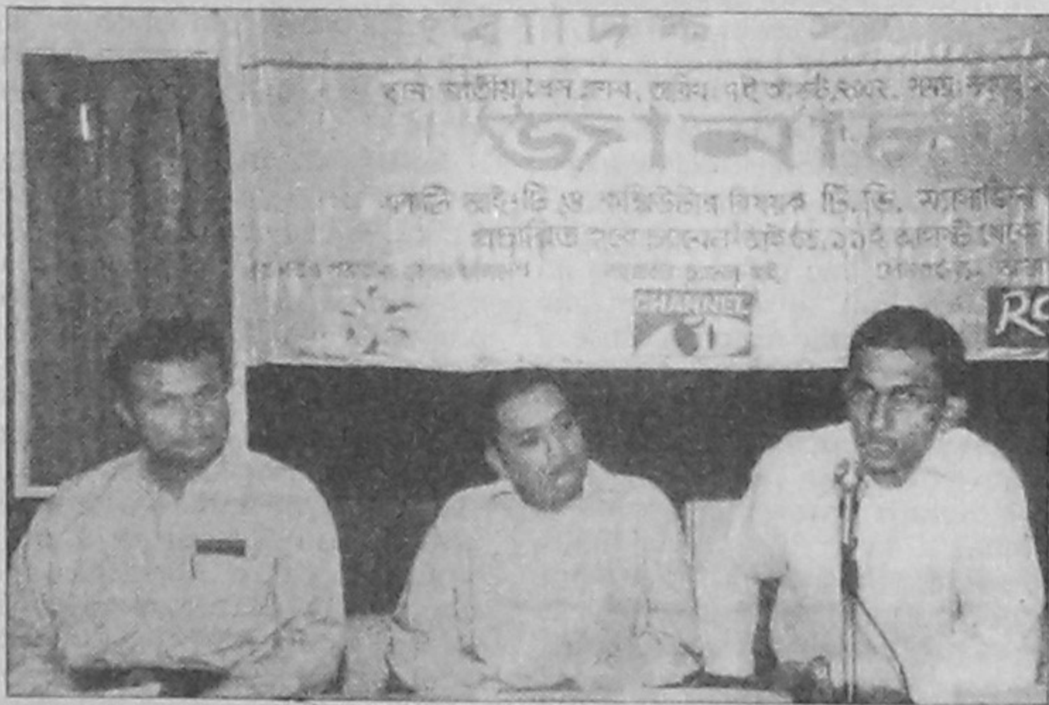
The Janala Bangladesh organised a press conference on a new TV programme on IT and computers titled 'Janala' at the National Press Club in the city yesterday.