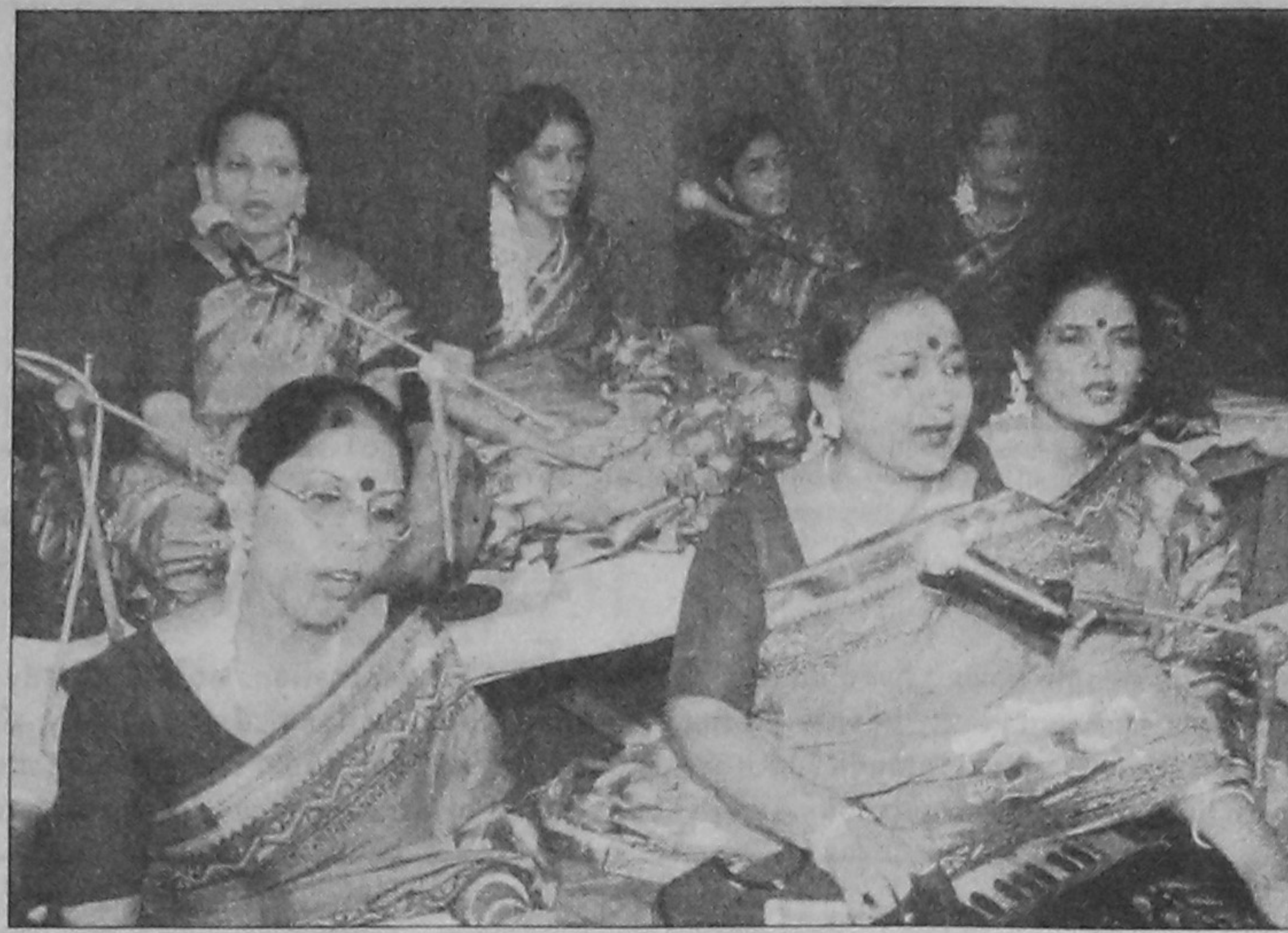
Artists of Pratiti rendering songs of monsoon at a function at the Shawkat Osman auditorium in the city yesterday.

The state-run BRIC has taken an initiative to introduce taxicab service in the city roads while the government allowed the import of 4,000 taxicabs under private sector to meet the transport needs of the residents.