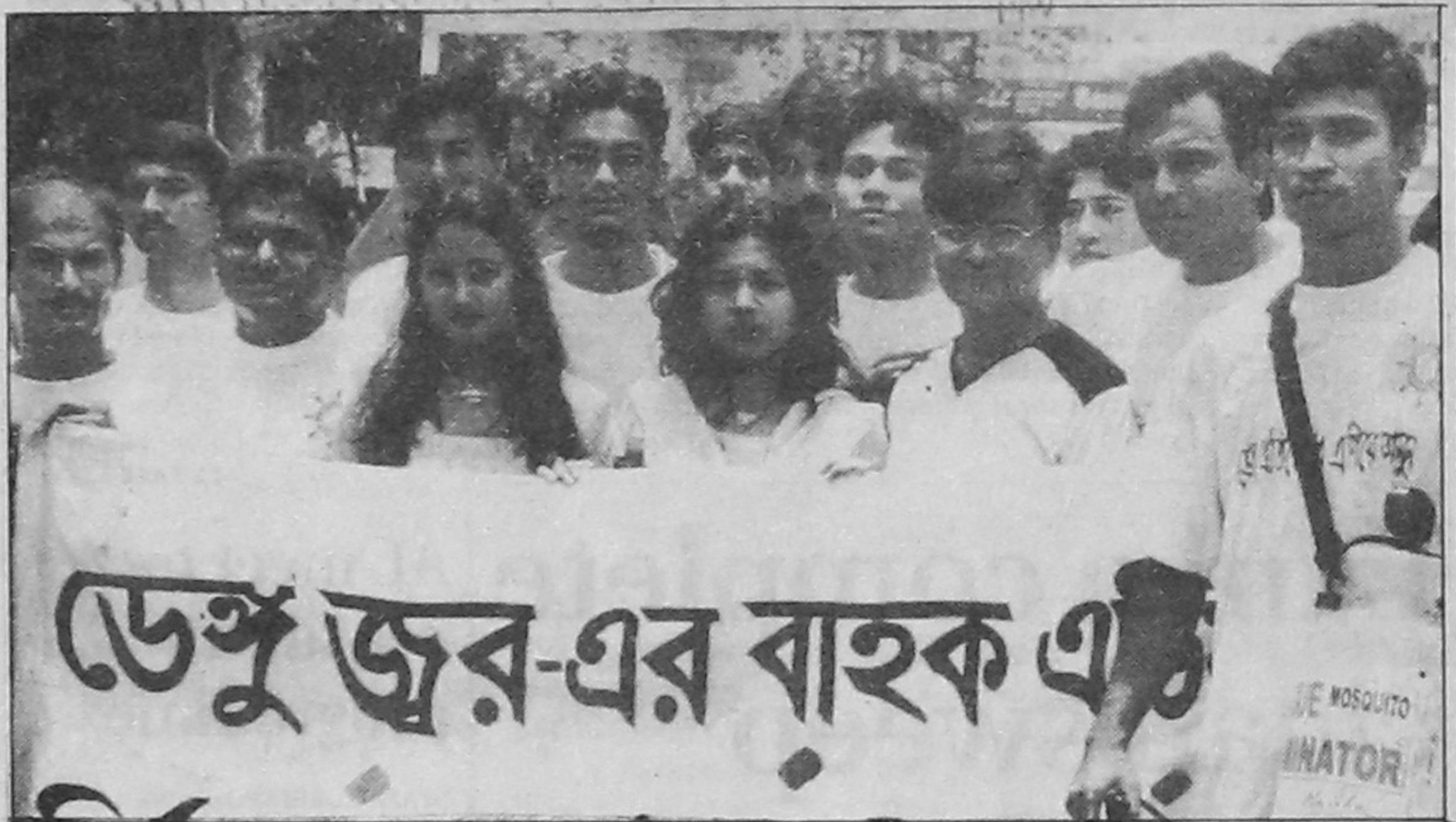
The Mariner Youngs Club took out a procession in the city yesterday to raise awareness about dengue fever.