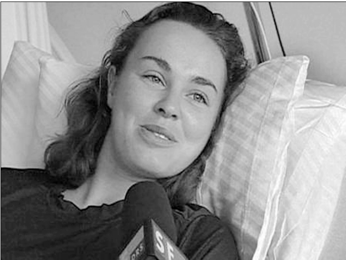
MARTINA HINGIS ... time to wake up

"We received her official request for a U.S. Open main draw singles wild-card from her management company on Monday morning. The USTA will announce the eight men and eight women who will receive main draw singles wild-card entries in the U.S. Open after our wild card