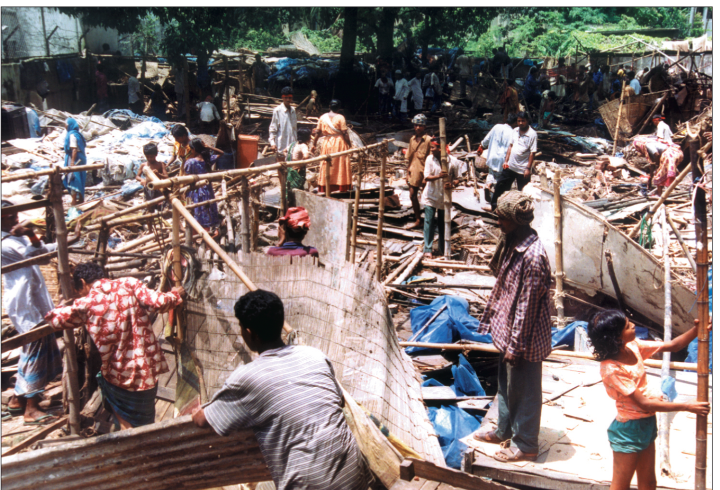
People sift through the remains of what once were their homes following a demolition drive near the the Willes Little Flower School in the city yesterday.