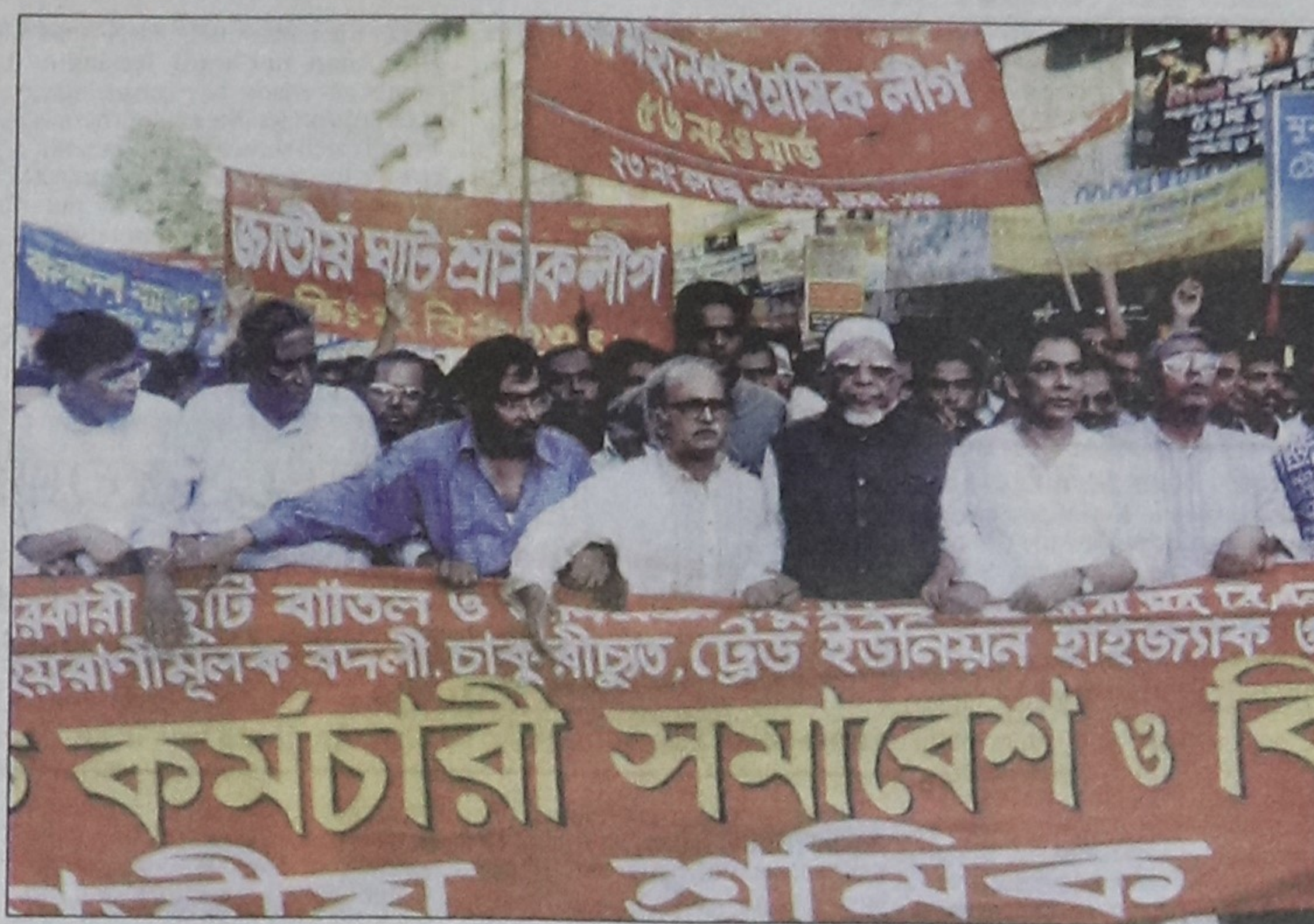
The Jatiya Samik League took out a procession in the city yesterday protesting price hike of essentials, closure of Adamjee Text Mills, police action on Dhaka University students and repression and torture on workers.

He said the government of Bangladesh values the bilateral relations with Japan.