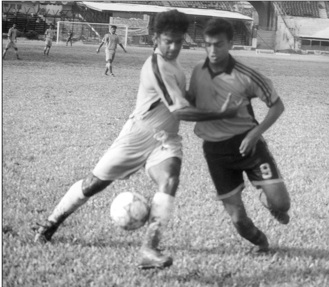
Action from the National Bank Premier Division Football League encounter between Brothers Union and Rahmatganj at the Bangabandhu National Stadium yesterday.