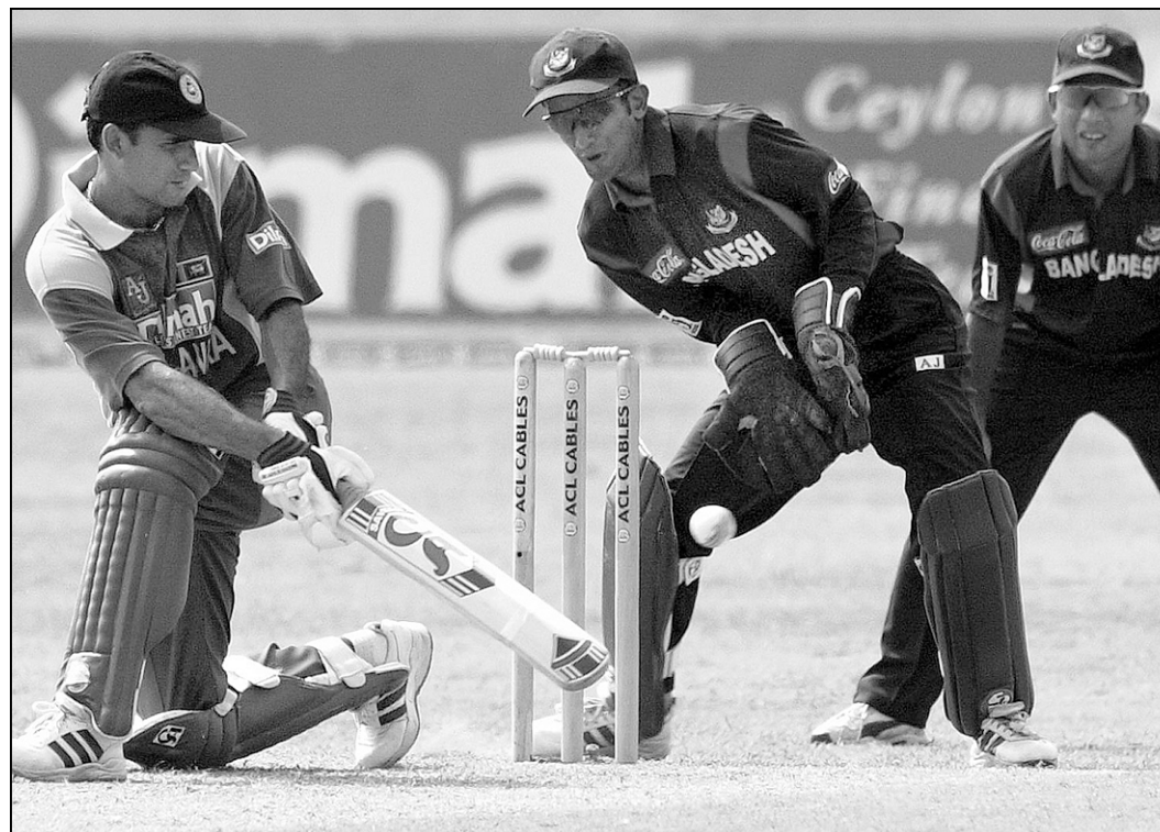
Sri Lanka's Marvan Atapattu sweeps one during his man-of-the-match innings against Bangladesh in the first one-day international in Colombo yesterday.