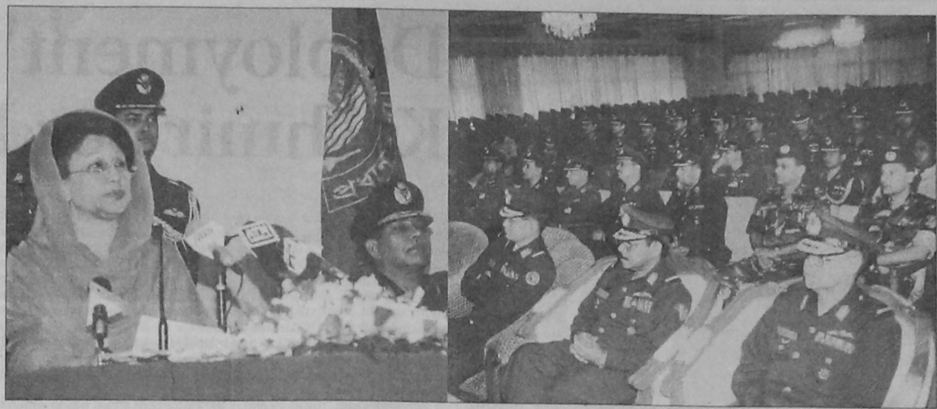
Prime Minister Khaleda Zia addressing the Air Force officers at a function at the Falcon Hall of Bangladesh Air Force in the city yesterday.

Meanwhile, Proshika signed a Letter of Understanding (LOU) with the WFP for distributing biscuits under its School Feeding Programme.