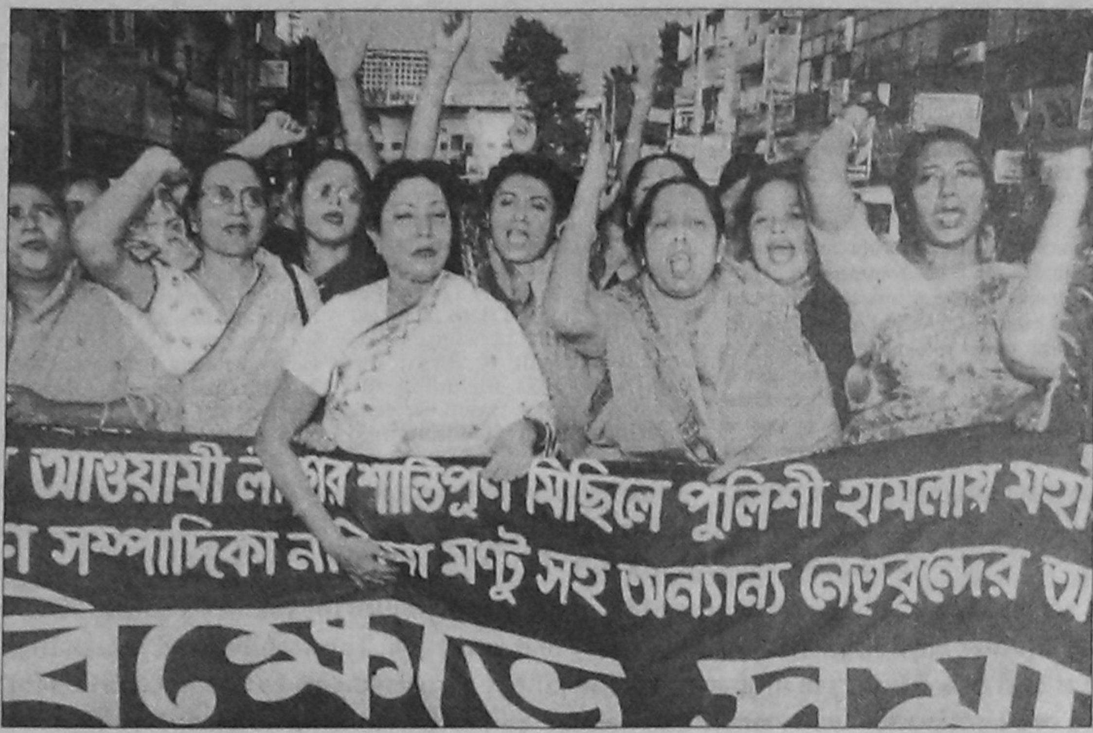
Mohila Awami League brought out a procession in the city yesterday protesting police action on Awami League procession.

The candidates have been advised to take their seat at the Academic Building of the Faculty of Business Studies by 9:30 am, said a press release.