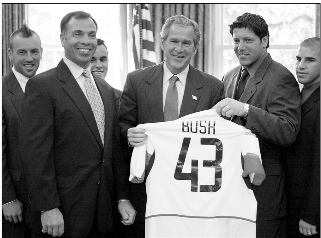
US President George W. Bush poses with his special shirt that was presented by the American football team which called on him at the White House on Friday.