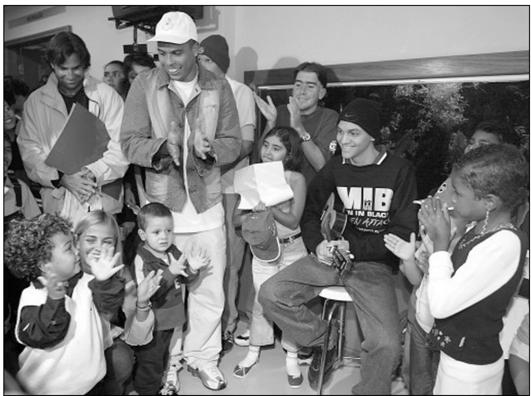
LET'S SING TOGETHER: Brazilian super-striker Ronaldo joins children in a song at the National Cancer Institute in Rio de Janeiro on August 2. The Golden Boot winner donated 35,000 dollars to fight against child cancer.

"It's merely impossible to talk to him. He gets nasty when you try to argue. A lot of players have left because of him. He really is not a smart person."