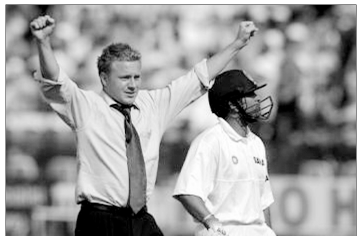
A VICTORY FOR HIM! As Sachin Tendulkar walks back to the pavilion an intoxicated man greets the Indian batting maestro on the fourth day of the first Test at Lord's on July 28.