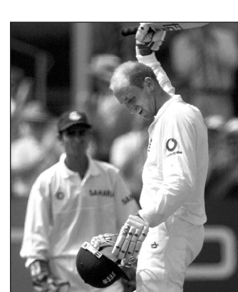
CRAWLEY... 100 n o

Hussain, who had dropped Sehwag at third slip off Flintoff straight after lunch when he had scored only three. Flintoff had an appeal for a catch down the leg-side rejected. beat Sehwag with a delivery that leapt from the pitch then saw Hussain get both hands to an attempted drive without retaining the ball.