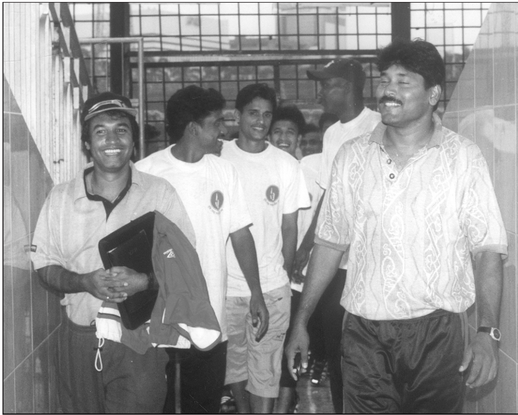
Players and officials of Muktijoddha Sangsad leave Bangabandhu Stadium yesterday after their National Bank Premier Division Football League fixture was called off.