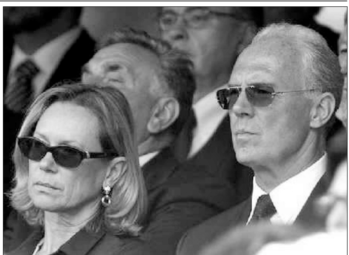
File photo of Franz Beckenbauer (R) and wife Sybille.

Beckenbauer, now 56, is the Bayern Munich president and also chairs the organising committee of the 2006 World Cup in Germany.