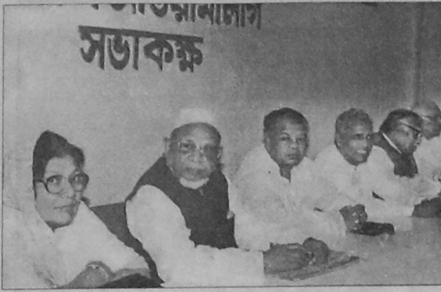
Acting president of Awami League Abdus Samad Azad speaking at a press conference at the party office in the city yesterday.