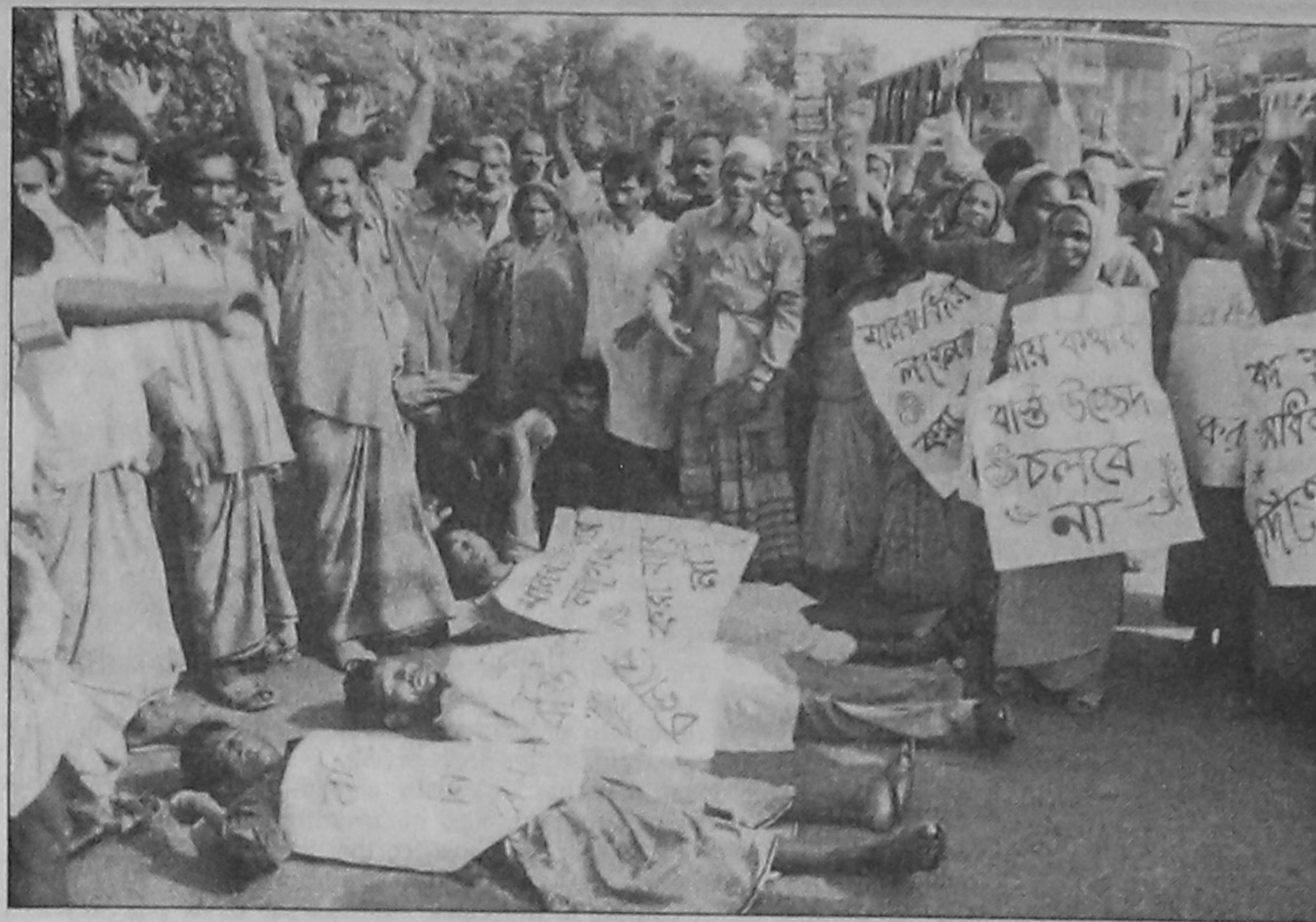
The slum-dwellers staged a sit-in at the Mirpur No. 10 intersection in the city yesterday protesting their eviction without rehabilitation.