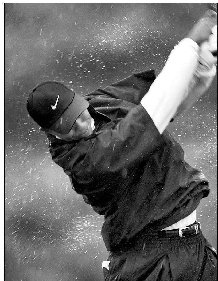
American golf maestro Tiger Woods in action during his third round of the British Open Championship at Muirfield on July 20.