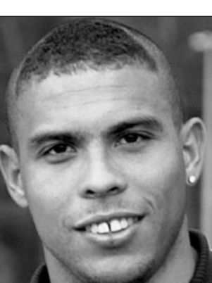
Ronaldo (Brazilian superstar) "In '98 I also played well. But when you lose, people forget."