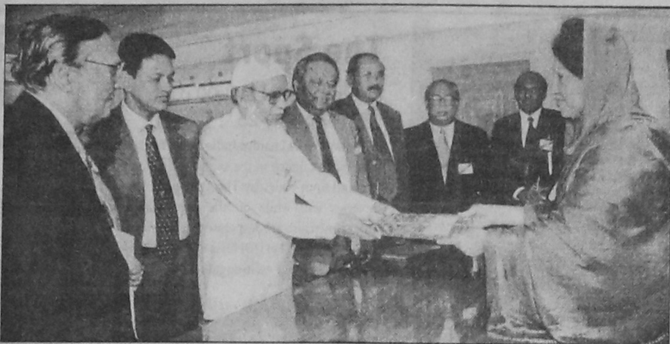
A delegation of the Expert Committee on Education Reform submitted its final report to Prime Minister Khaleda Zia at her office yesterday with recommendations for comprehensive reforms in the education sector.

STAFF CORRESPONDENT Election to the executive body of Magura District Association will be held at the BIM auditorium at Sobhanbag in the city on August 9, says a press release. The nomination paper will be available from July 18 to 21 and the last date of submitting the nomination paper is July 22. The last date of withdrawing the nomination is July 25. The final list of the candidates will be published on the following day.