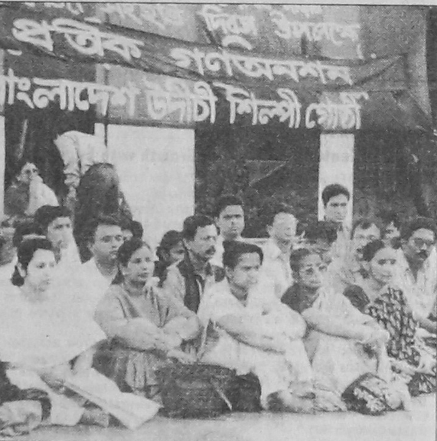
The Bangladesh Udichi Shilpi Goshthi staged a token hunger strike at the Central Shaheed Minar in the city yesterday protesting the closure of Adamjee Jute Mills.