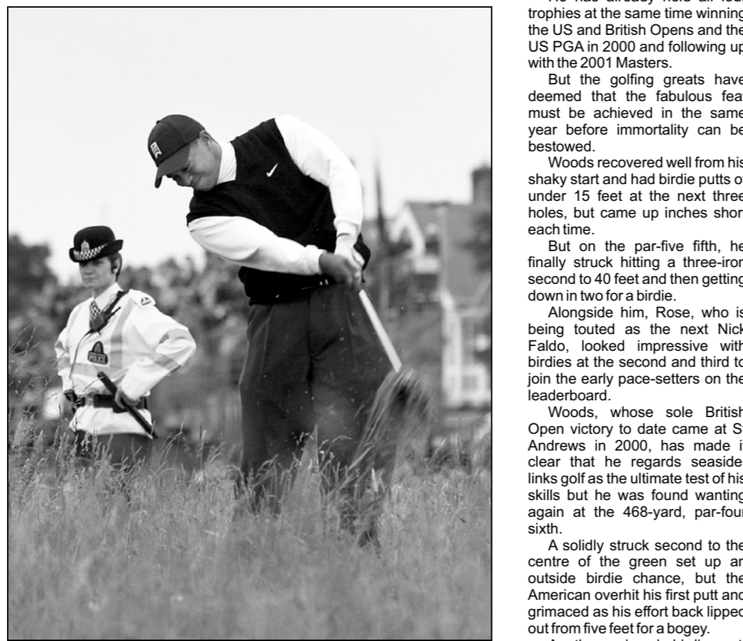
Tiger Woods negotiating the rough at the British Open yesterday.

If Bruno Metsu can transform an unknown quantity like Senegal into world-beaters, isn't it only logical to hope that a competent coach could someday turn the fortunes of Bangladesh's football also?