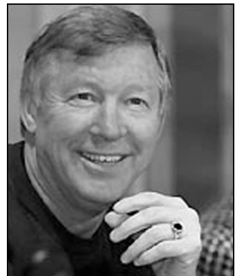
ALEX FERGUSON target list are rumoured to include Alessandro Nesta, Roberto Ayala and Lilian Thuram.

Reds chief executive Peter Kenyon's offer some weeks ago. Earlier Wednesday an anguished Ferdinand said: "I have been torn apart over the past three days while I tried to make up my mind."