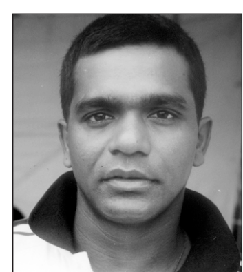
AMINUL ... 66 the three-day tour match between

SCOREBOARD Final scoreboard on the third day of